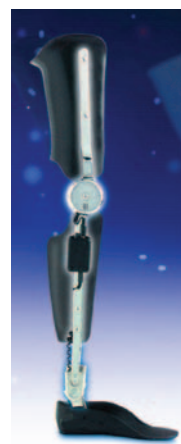
E-Knee Courtesy Becker Orthopedic