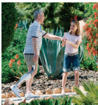
E-MAG Active KAFO

The E-MAG Active system extends the benefits of a stance control knee-ankle-foot orthosis and provides an added level of safety to patients with no ankle function. In lieu of an ankle sensor or weight-sensing footplate, an on-board gyroscope monitors the affected limb's position within the gait cycle at all times and controls an electro-mechanical knee unlocking mechanism accordingly to enable flexion during swing phase and ensure a stable knee for weight-bearing.