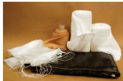
Reinforcing fabrics for O&P laminations

Whatever the needs and desires of our patients, we are prepared to fabricate the most appropriate materials into each device we create.