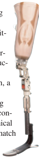
Above-knee prosthetic limb incorporating Total Knee polycentric unit with hydraulic control and stance lock

Single-axis vs. polycentric. The single-axis knee , essentially a simple hinge mechanism, usually incorporates a mechanical friction control and frequently a manual lock. Its mechanical simplicity and ease of maintenance makes it a popular choice for geriatric or infirm patients. On the minus side, the single-axis knee provides minimal stability and generally limits the patient to a single, slow walking speed.