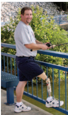
Entegra hydraulic knee Courtesy Hosmer-Dorrance Corp.

For such amputees, a key determinant of success is the prosthetic team’s ability to provide an appropriate knee component to match the patient’s age, state of health, activity level and mental acuity. Knee selection involves consideration of many attributes: biomechanical performance, energy requirements, safety, ease of maintenance, cost, and operational complexity, among others. The knowledge and experience of the prosthetist are vital to getting the knee choice right.