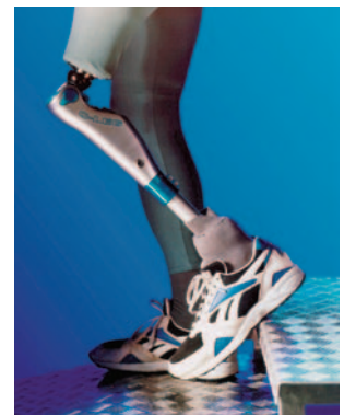
'Smart' knees like the C-Leg® help amputees with life's ups and downs.

In real time the decision-making chip signals the swing-phase control to react so the limb will be ready for heel strike at the appropriate instant and place. Then at heel strike, the microprocessor signals the knee to restrict flexion until late stance phase, providing needed stability for full weight-bearing, then gradually allows flexion in preparation for toe-off. Smart knees can further detect danger of falling or slipping and react to keep the knee from contributing to a fall.