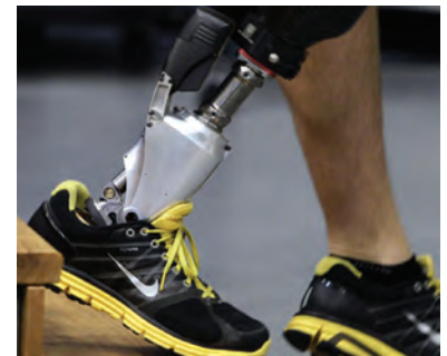
iWalk BiOM prosthesis

In place of the passive spring core of the typical contemporary prosthetic foot, the battery-powered BiOM incorporates microprocessors, gyroscopes and motors to sense the wearer’s ambulatory purpose and respond with the appropriate positioning and force, effectively replacing the function of the absent calf muscle and Achilles tendon.