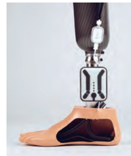
Harmony® e-pulse transtibial vacuum system

With pure suction , precise socket fit enables residual limb skin to remain in full contact with the socket wall