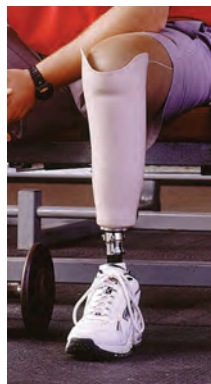
Transtibial PTB socket with locking pin suspension

A total contact socket enhances venous return, limits edema and reddening/inflammation on the distal end of the anatomic limb, and helps distribute the load somewhat.