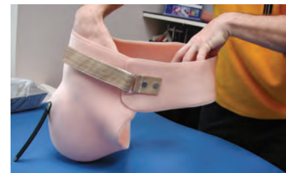
Short transfemoral liner with waist belt

A suprapatellar cuff, which encircles the thigh over the femoral condyles and attaches to the socket with straps, may be a good choice for transtibial patients who have good knee stability. It is normally used