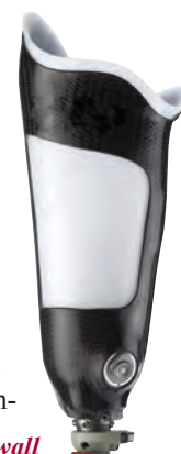
Double wall transfemoral socket

A hydrostatic weight-bearing socket is a specific version of the TSB design, cast in a compression environment to achieve uniform pressure distribution across residual limb tissues. This design encourages tissue elongation within the liner, increasing padding at the distal residual limb and reducing potential for skin breakdown.