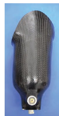
Laminated transtibial socket

Today’s below-knee sockets are of two primary types: The “old reliable” patellar tendon-bearing (PTB) design focuses weight-bearing stress on certain pressure-tolerant structures, such as the patellar tendon and medial tibia flare, and relieves pressure-sensitive areas. The PTB socket is still preferred by many patients, notably those with shorter or bony residual limbs. It generally is not a good choice for patients with residual limb scar tissue and/or chronic skin breakdown.