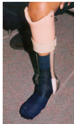
Ankle-foot orthosis with patellar tendon-bearing support.

Despite decades of progress in managing the disease, the course of diabetes still frequently culminates in varying degrees of lower-limb morbidity and ultimately amputation (see statistics). An estimated 90,000 lower-limb amputations were performed on diabetic patients in 2007 with vascular insufficiency secondary to diabetes as the predominant cause.