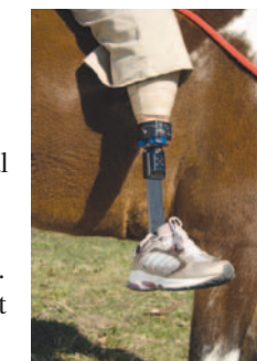
LimbLogic VS system built into a trans-tibial prosthesis

Once set by the prosthetist, LimbLogic continually monitors and maintains the desired vacuum pressure within preset limits; the wearer can adjust the pressure