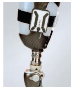
E-pulse in trans-femoral application