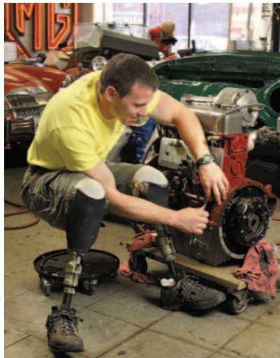
Vacuum systems such as the Harmony® give wearers unparalleled "attachment" to their prostheses.