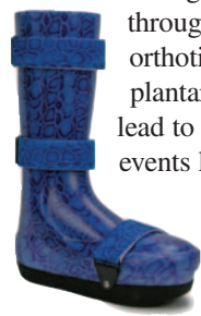
Charcot Restraint Orthotic Walker

O&P concern for diabetic patients, whether or not they have already undergone an amputation, stresses sound foot management through regular careful observation, patient education and orthotic-pedorthic support. The goal is to prevent elevated plantar pressures and trauma, which unresolved can quickly lead to plantar ulcerations, often the first insult in a series of events leading to amputation.