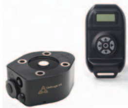
LimbLogic VS opens vacuum suspension to above-knee amputees.

Testing with the system confirmed its effectiveness: For the average size limb (13 inches proximal circumference), an extraction force exceeding 150 pounds was required to separate liner from socket under vacuum. (For reference, extraction forces encountered in daily activities seldom exceed 20 pounds.) By comparison, less than one pound extraction force can cause separation with all other suspension methods.